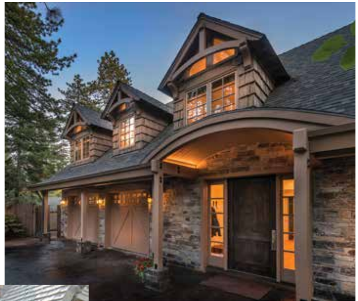
OPPOSITE PAGE, FROM TOP: Two large glass Panoramic doors were installed on the lower-floor addition, enabling a vast swath of wall to open to the outdoors | A natural granite outcropping was used for a gas fire pit off the great room THIS PAGE: Fett spruced up the curb appeal by adding wood curves on the existing front dormers and creating a charming archway over the entry